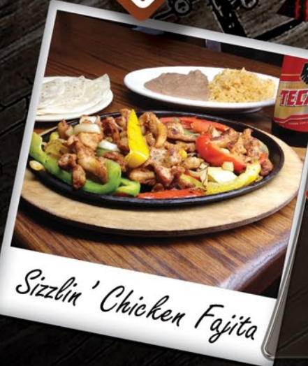
Sizzlin' Chicken Fajita

Chicken machaca, served with rice, refried beans and flour tortilla.