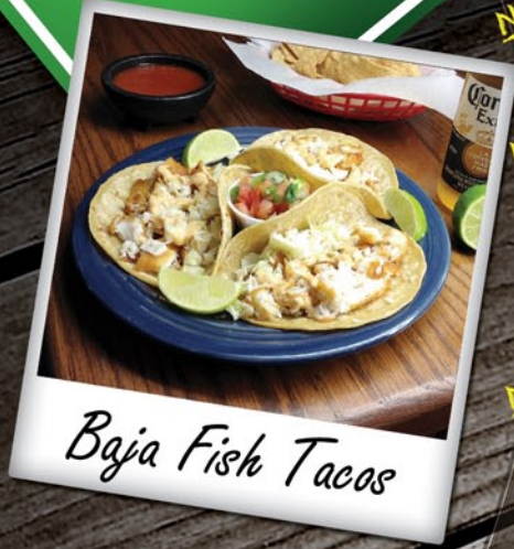
Baja Fish Tacos