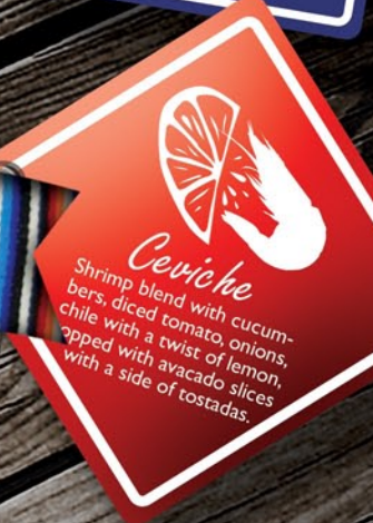
Ceviche Shrimp blend with cucumbers, diced tomato, onions, chile with a twist of lemon, topped with avocado slices with a side of tostadas.