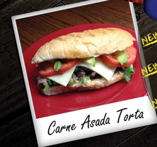
Carne Asada Torta

Add refried beans to any of your Tortas. 2.00