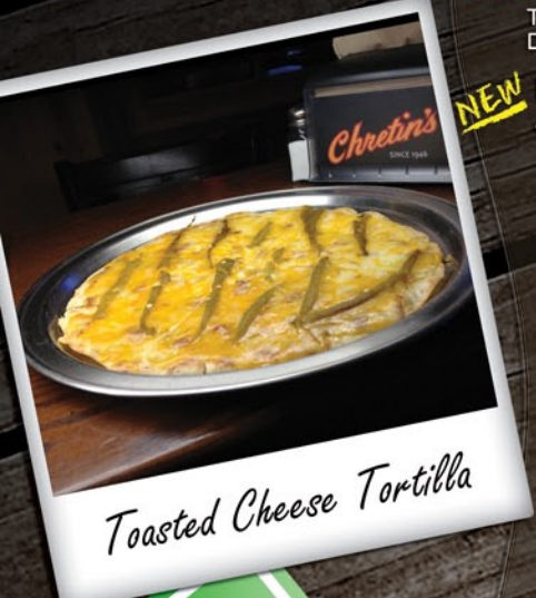
Toasted Cheese Tortilla